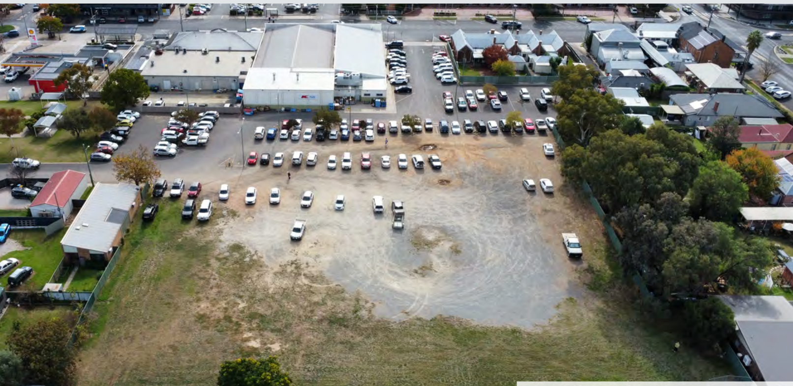
Proposed site of the Mortimer Street Precinct development

The region is set to benefit from $3.3 million in federal grants recently announced. Council has secured $220,000 through the Regional Airports Program for improvements to the Mudgee Regional Airport runway and open drainage system, to ensure continued delivery of critical medical and bushfire fighting services.