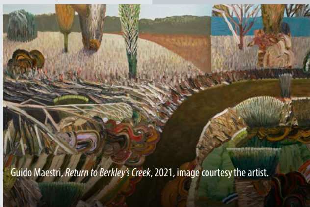
Guido Maestri, Return to Berkley's Creek , 2021, image courtesy the artist.

Mudgee Arts Precinct is proudly funded by the Australian Government and the NSW Government's Regional Cultural Fund in association with Mid-Western Regional Council.