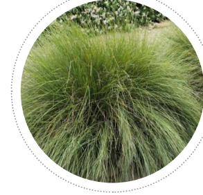
Poa sieberiana Snow Grass