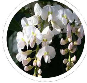
Hardenbergia violacea False sarsaparilla