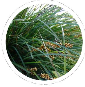
Lomandra 'Tanika' Many-flowered Matt-Rush