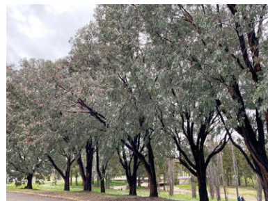
Eucalyptus sideroxylon Mugga Ironbark