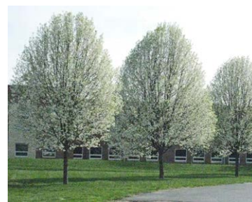
Pyrus calleryana 'Cleveland Select' Cleveland Pear