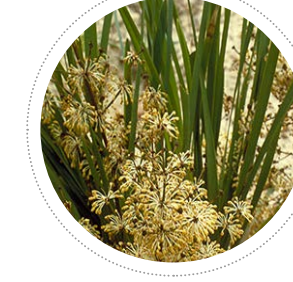
Lomandra multiflora Many-flowered Mat-Rush