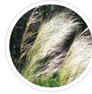
Austrostipa scabra Speargrass