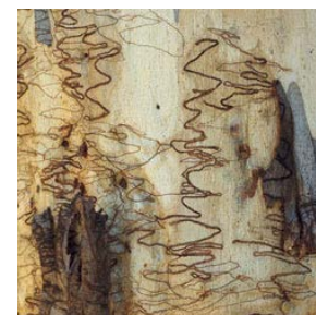
Eucalyptus rossii scribbly Gum