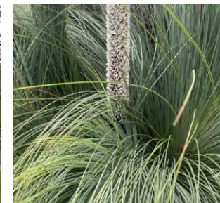
Xanthorrhoea australis Grass Tree