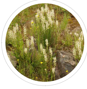
Stackhousia monogyna Creamy Candles