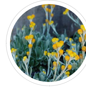
Chrysocephalum apiculatum Yellow Buttons