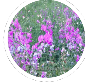
Swainsona gaegifolia Swainson Pea