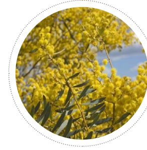
Acacia decora Western Silver Wattle

It is intended to use the planting design to provide seasonal colour and change and some fun pops in the landscape to provide a point of difference and something unexpected, like a native wildflower meadow or a bush herbs and medicine picking garden.