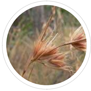
Themeda australis Kangaroo Grass