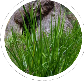
Lepidosperma laterale Variable sword-sedge