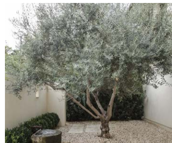
Olea europaea European Olive