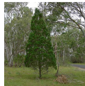
Callitris endlicheri Black Cypress