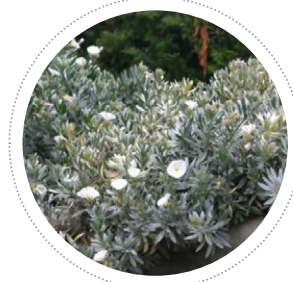
Convolvulus cneorum Silverbush