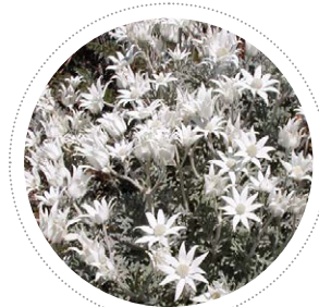
Actinotus helianthii Flannel Flower