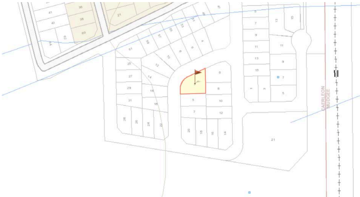
Figure 1: Aerial View of Subject Site and Surrounding Properties

The subject site is located at 3 Margaret Lane, Caerleon and is legally defined as Lot 1223 DP 1302496. The site is arranged on a north-south tangent and is orientated to address the site frontage of Margaret Lane to the north and west. The aerial image below shows the orientation of the subject site and its location relative to surrounding properties.