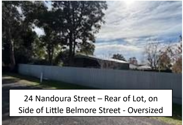
24 Nandoura Street – Rear of Lot, on Side of Little Belmore Street - Oversized