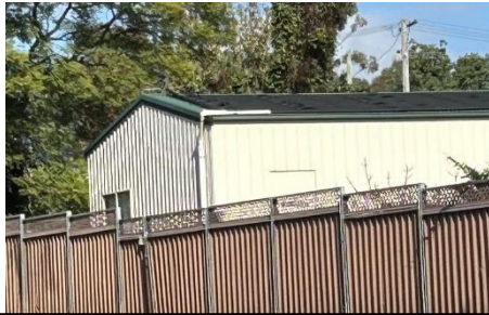
15 Bayly Street – Rear of Lot, on Side of Nandoura Street - Oversized