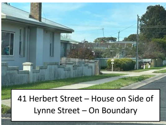
41 Herbert Street – House on Side of Lynne Street – On Boundary