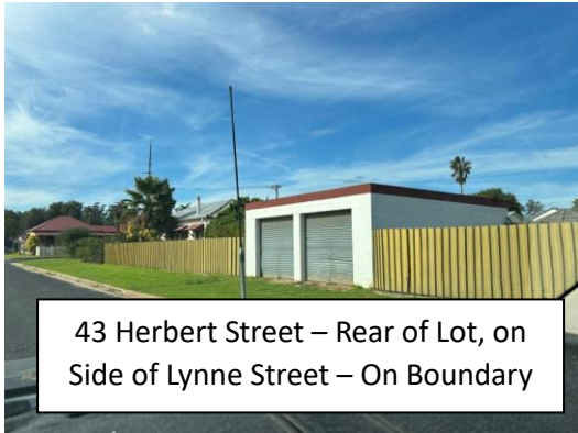
43 Herbert Street – Rear of Lot, on Side of Lynne Street – On Boundary