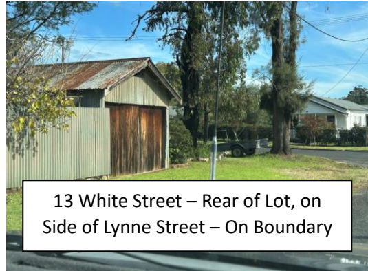
13 White Street – Rear of Lot, on Side of Lynne Street – On Boundary