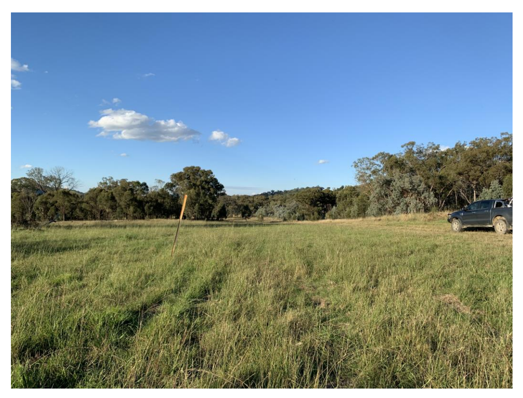
Plate 1 – North facing view

The site is sloping slightly to the north east. The block has existing rural farmland surrounding the area.