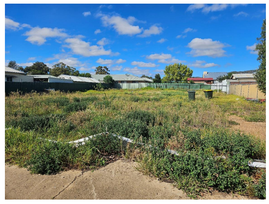
Plate 1 – South facing view

The site is sloping slightly to the north. The block has existing buildings and established houses in the vicinity.