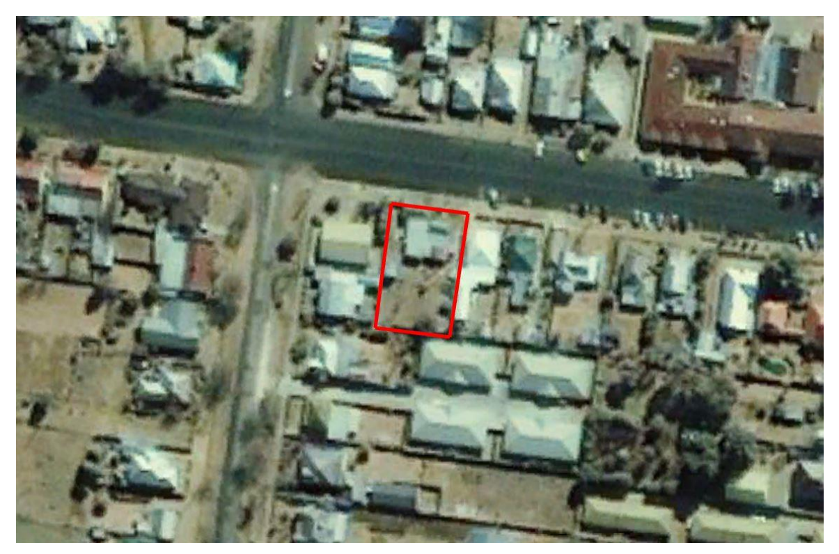
Plate 2 – Aerial Image 2002.

A review of Google Earth imagery of the site indicates that a building had existed on the site since before an image taken in 2002. Images exist back to 1985, yet the image is not clear enough to determine what was on the site. The building is expected to have been constructed well before 2002. The building has been removed from site, reference is made to AS2870 Clause 1.3.3 (a) Abnormal moisture conditions. See 2002 aerial image below: