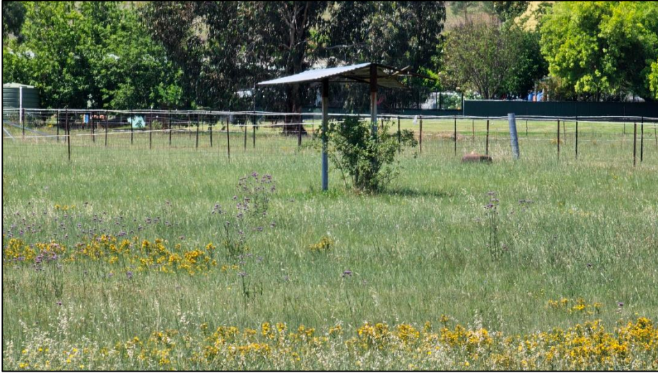
Looking north over the recommended application area.