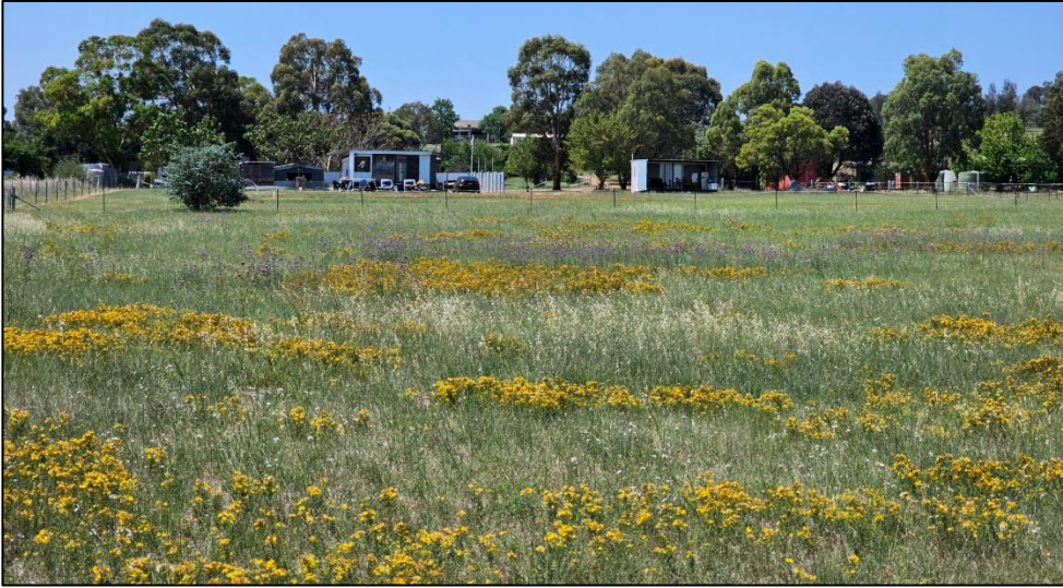
Looking north over the recommended application area.