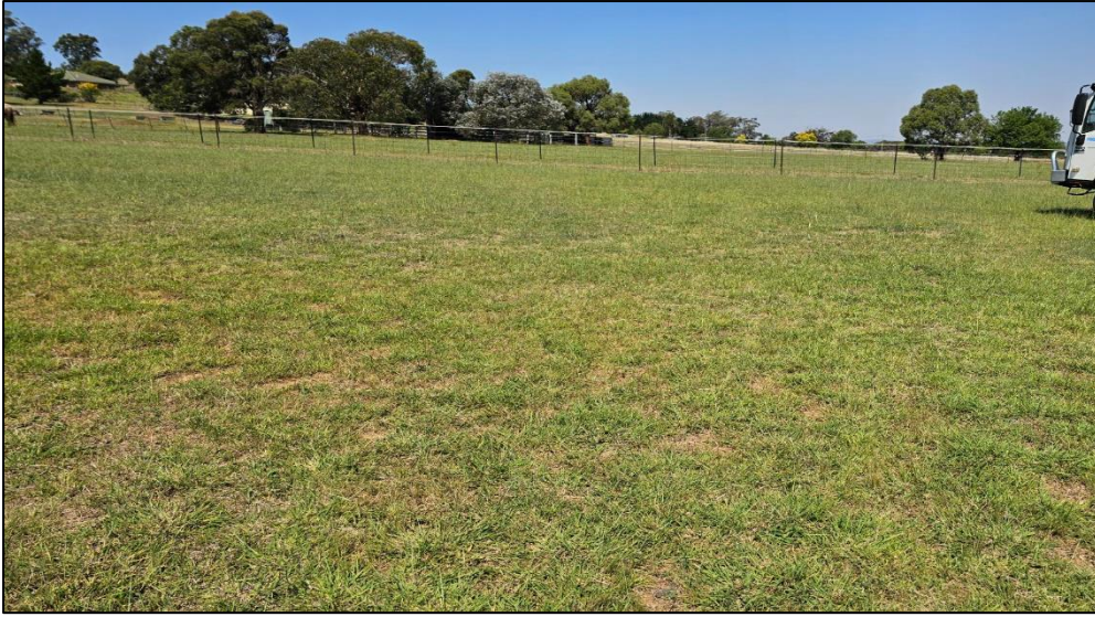
Looking east over the recommended application area.