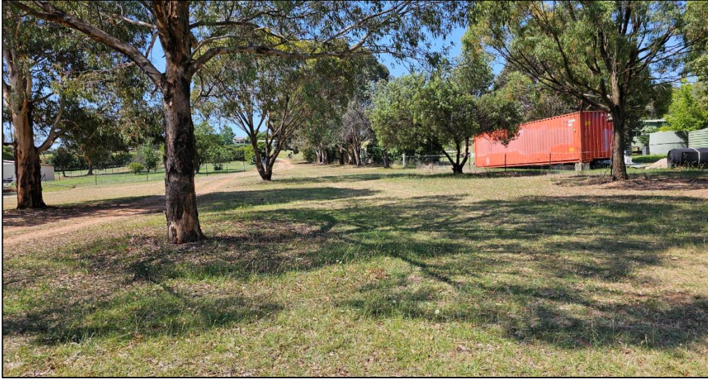
Looking north over the recommended application area.