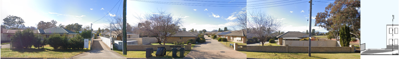
GEORGE STREET NORTH