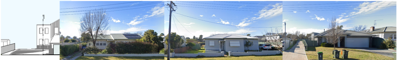
GEORGE STREET SOUTH