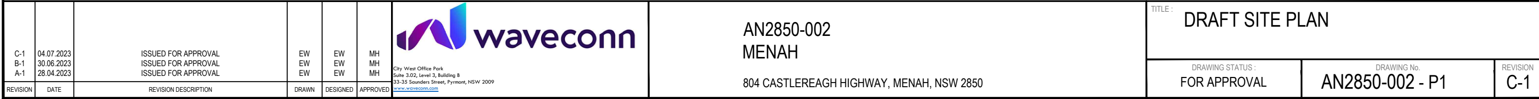
SITE PLAN SCALE 1:2500

AN2850-002 MENA 804 CASTLEREAGH HIGHWAY, MENA, NSW 2850