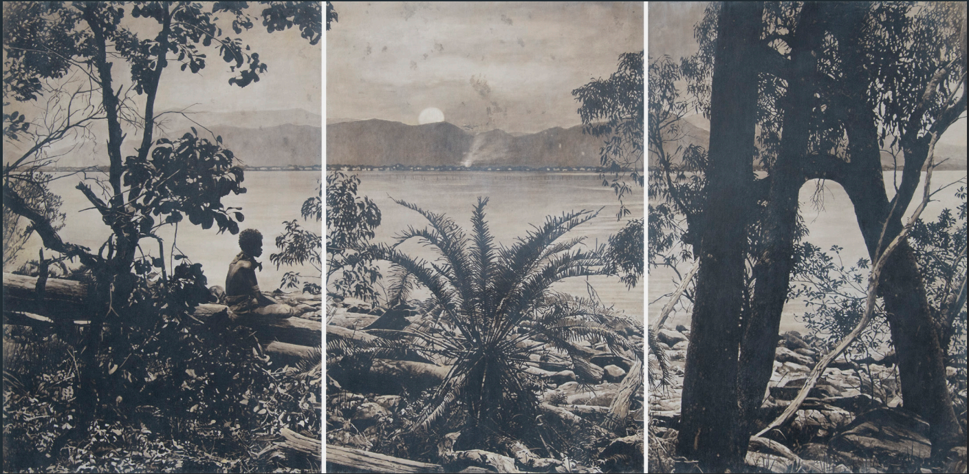
Danie Mellor, On the edge of the darkness (the sun also sets) , 2020 © the artist