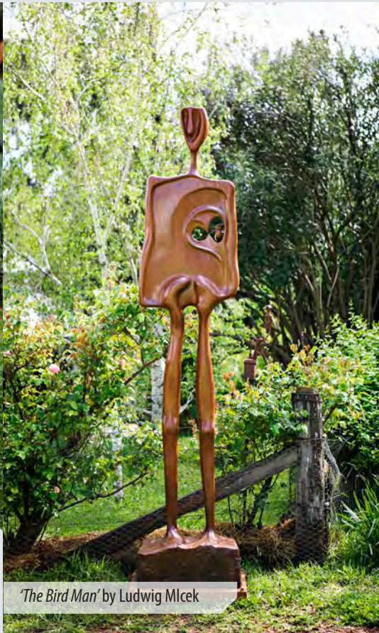
'The Bird Man' by Ludwig Mlcek