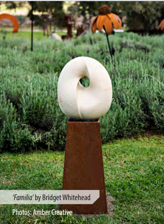
'Familia' by Bridget Whitehead