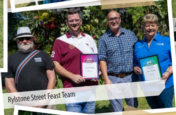
Rylstone Street Feast Team