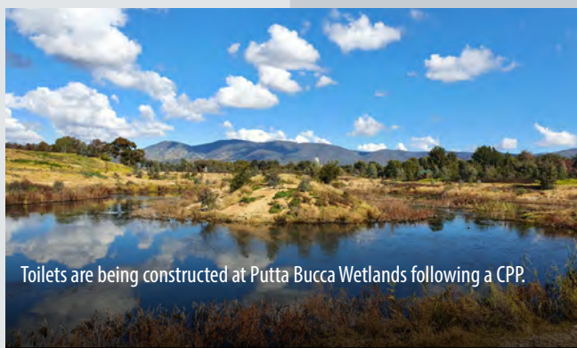
Toilets are being constructed at Putta Bucca Wetlands following a CPP.

of Council actions in the 2020/21 Delivery Program completed