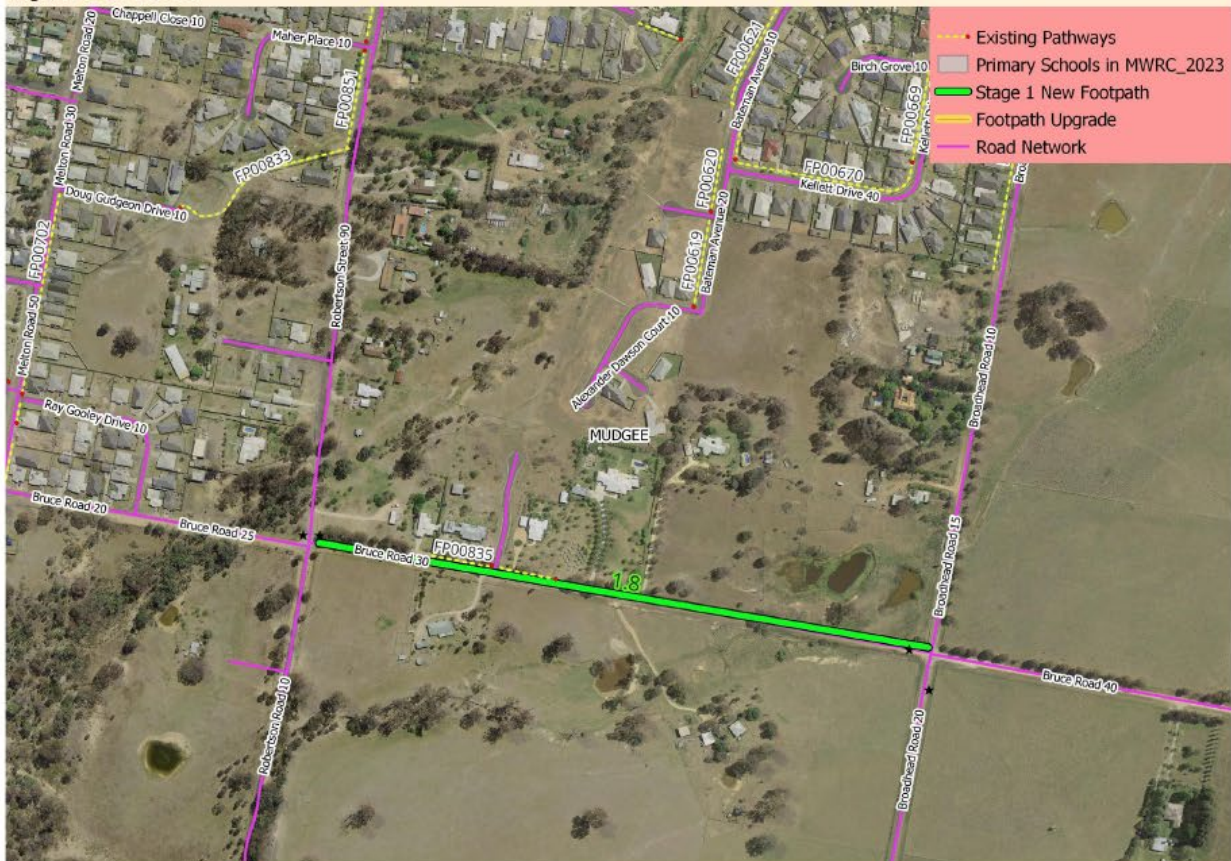
Figure 3: Bruce Road