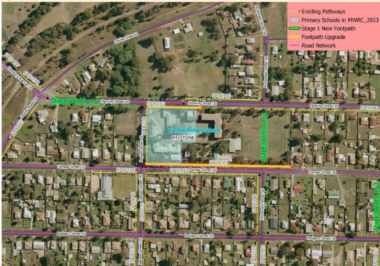
Figure 8: Kandos Primary School