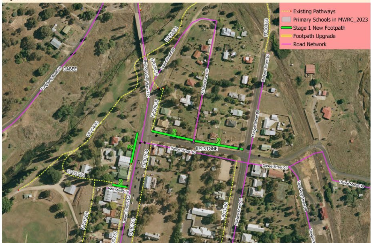
Figure 6: Louee Street, Hall Street and Dabee Street