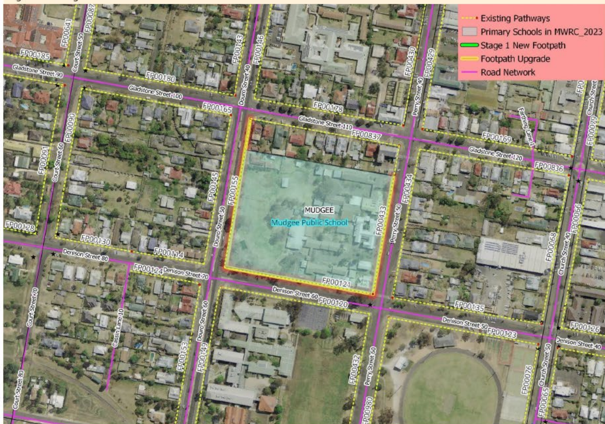
Figure 10: Mudgee Public School