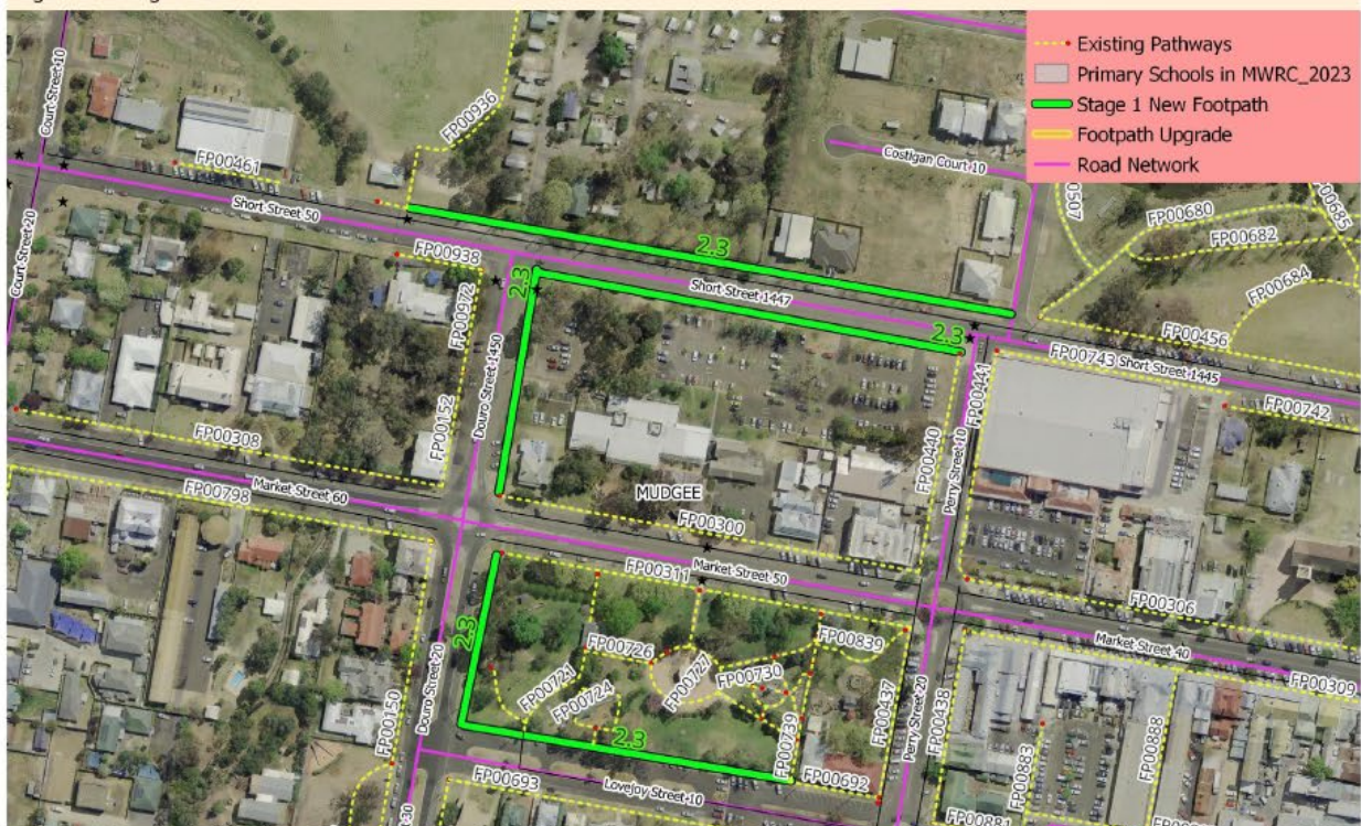
Figure 1: Mudgee CBD