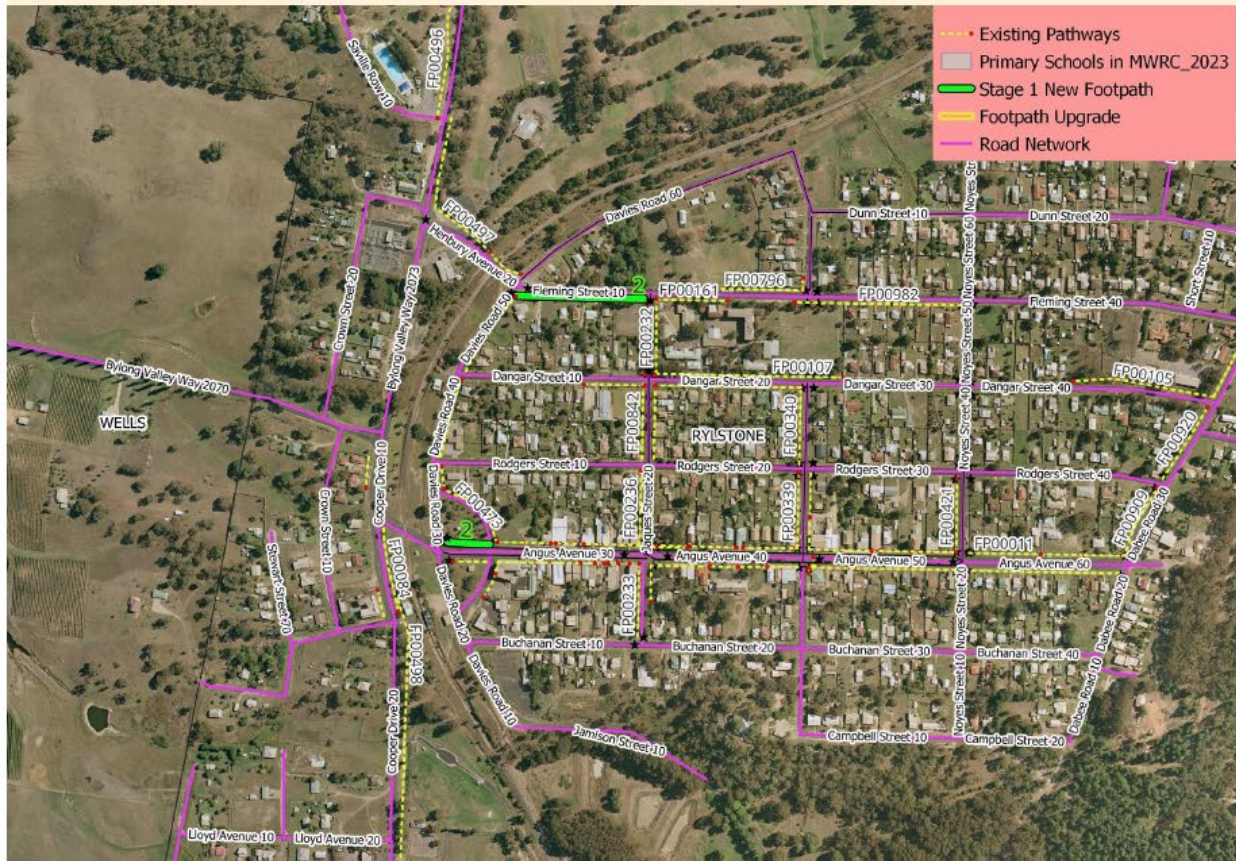
Figure 7: Fleming Street and Angus Avenue