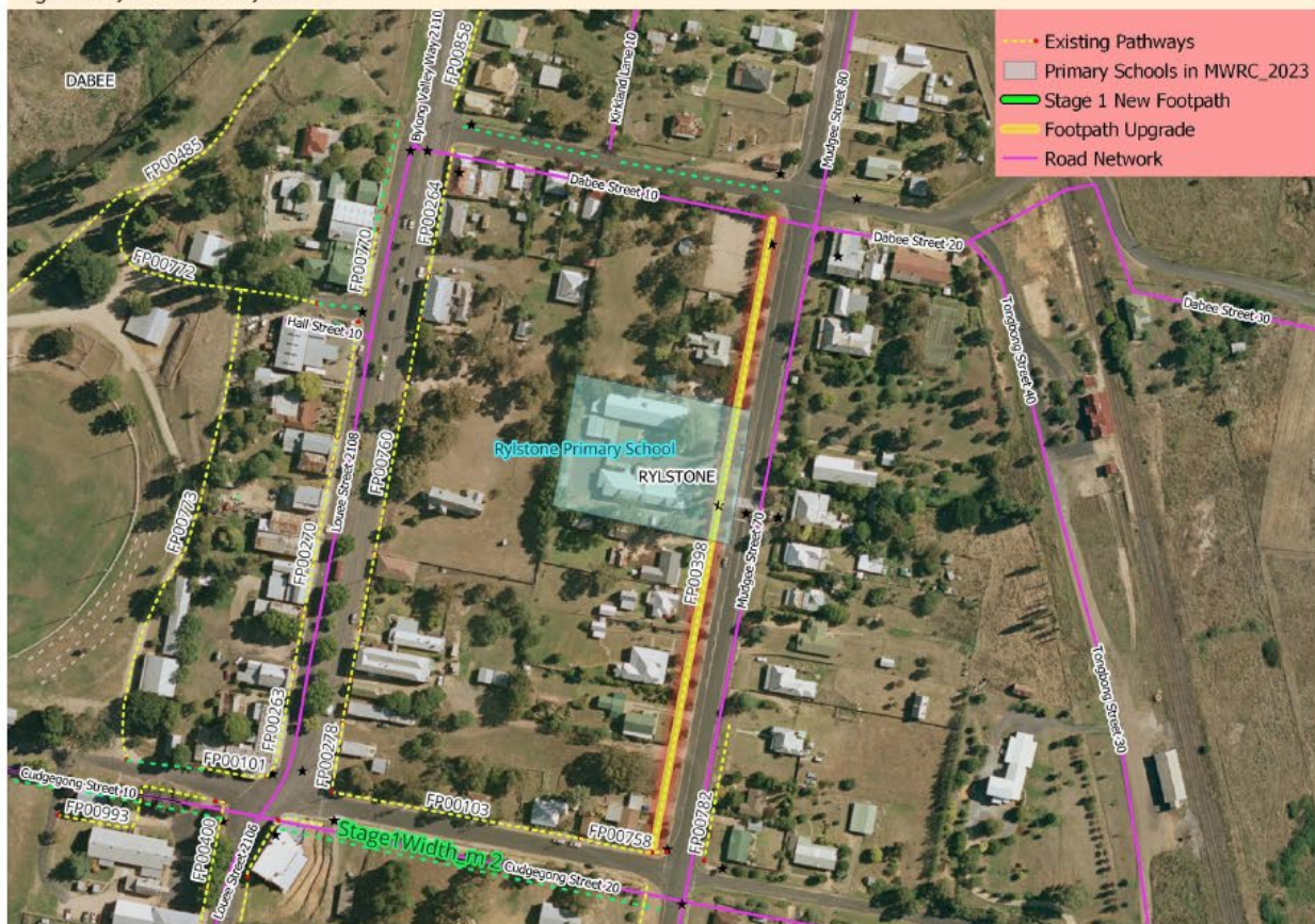
Figure 9: Rylstone Primary School