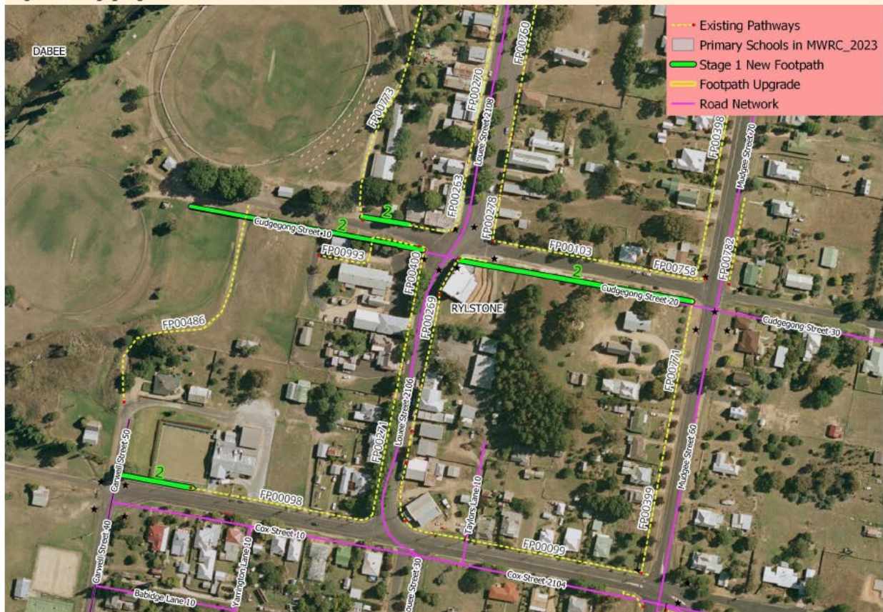
Figure 5: Cudgegong Street and Cox Street