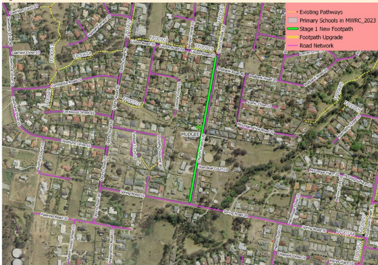
Figure 2: Church Street