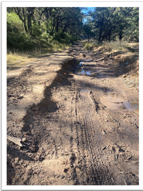
Eroded track. 4WD only.