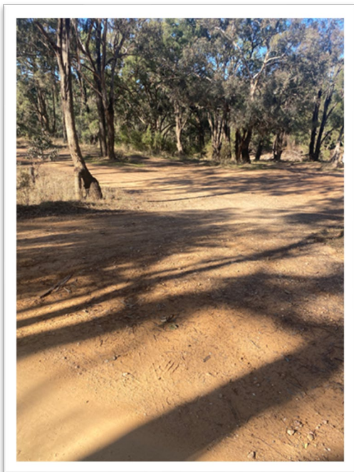
Internal tracks to river. Possible 2WD with clearance.