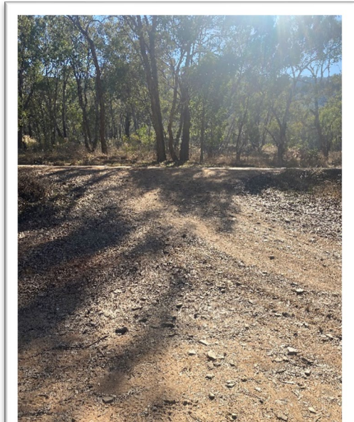
Entry to site. Accessible 2WD