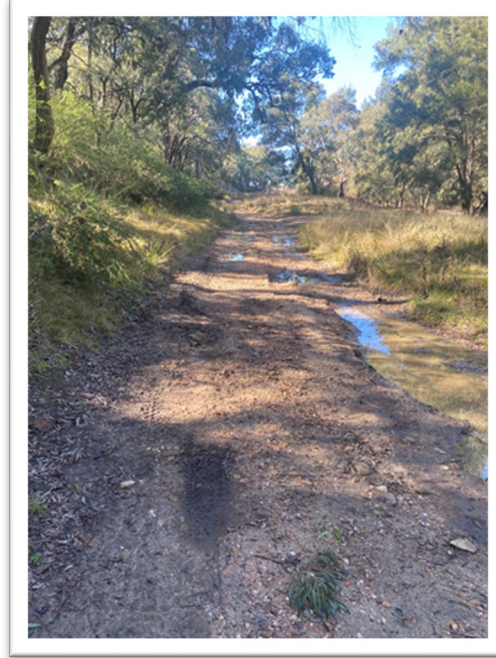
Eroded track. 4WD only.