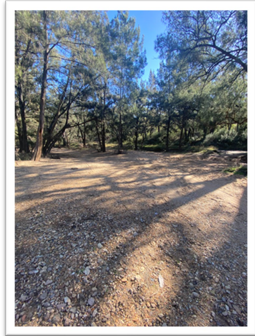
Internal tracks to river. Sandy base 4WD only.