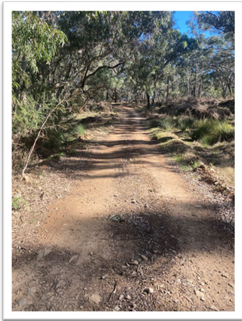
Internal tracks to river. Possible 2WD with clearance.