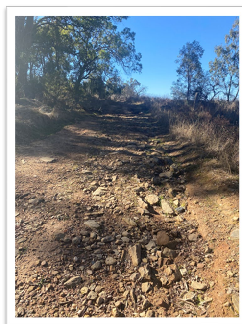
Eroded track. Toward eastern entry.