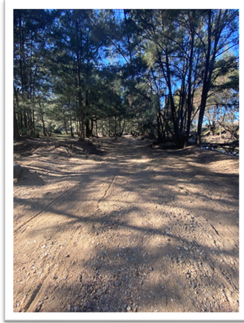
Sandy track at river bank 4WD only.