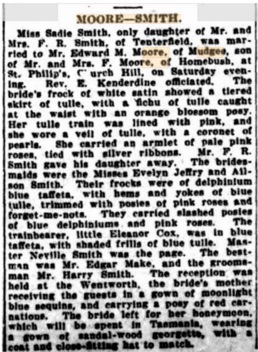
The Sydney Morning Herald Mon 21 Nov 1927

The Caerleon woolshed is over 100 years old and was the first built in the area. It was used by all the properties in the area for some time.