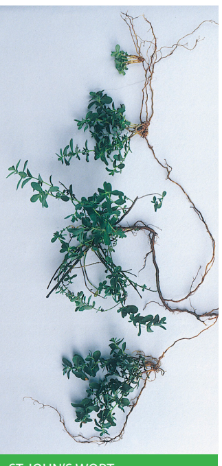
ST JOHN'S WORT: BROAD LEAF STRAIN