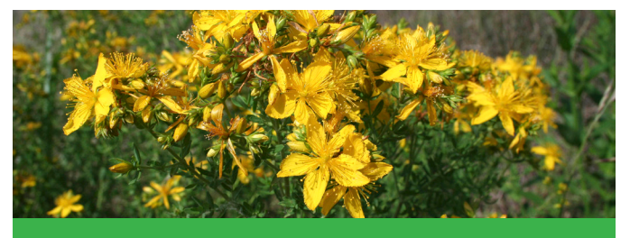
ST JOHN'S WORT: AN INVASIVE WEED CONTAINING HYPERICIN

Hypericin poisoning can cause skin damage, photosensitisation and in some cases, death. A single plant can produce up to 30,000 seeds per year.