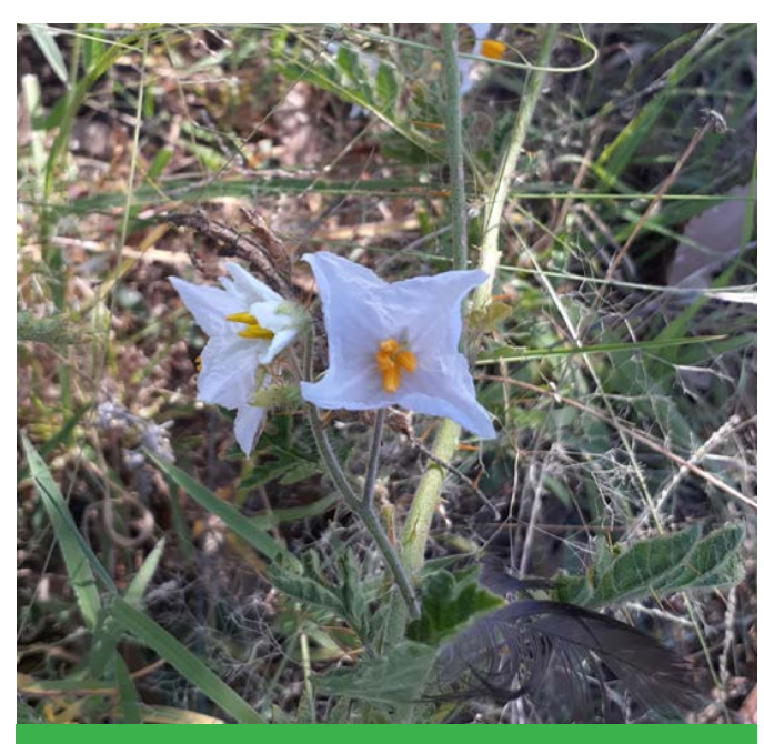
FLOWERS GROW TO 3–5CM IN SIZE, IN GROUPS OF 4–12