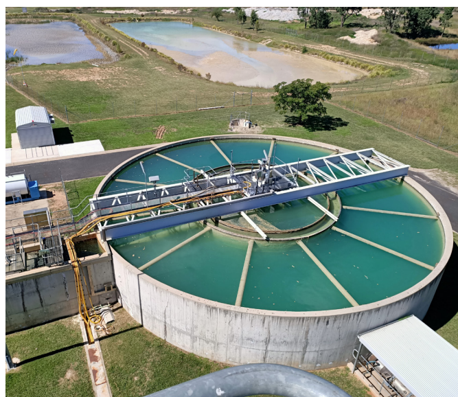
Mudgee Water Treatment Plant