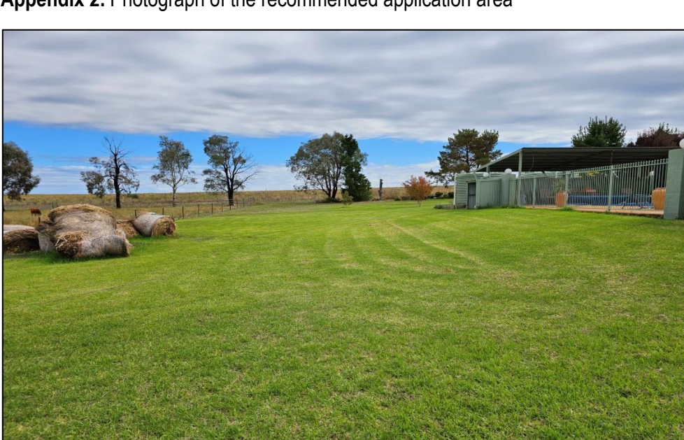
Appendix 2. Photograph of the recommended application area

Looking west over the recommended the application area