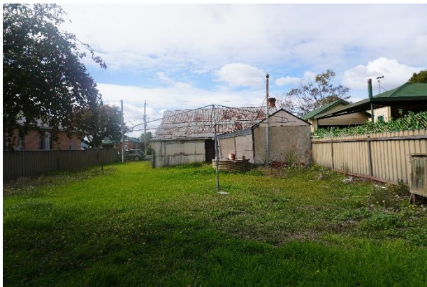
Externals 11 Rear view