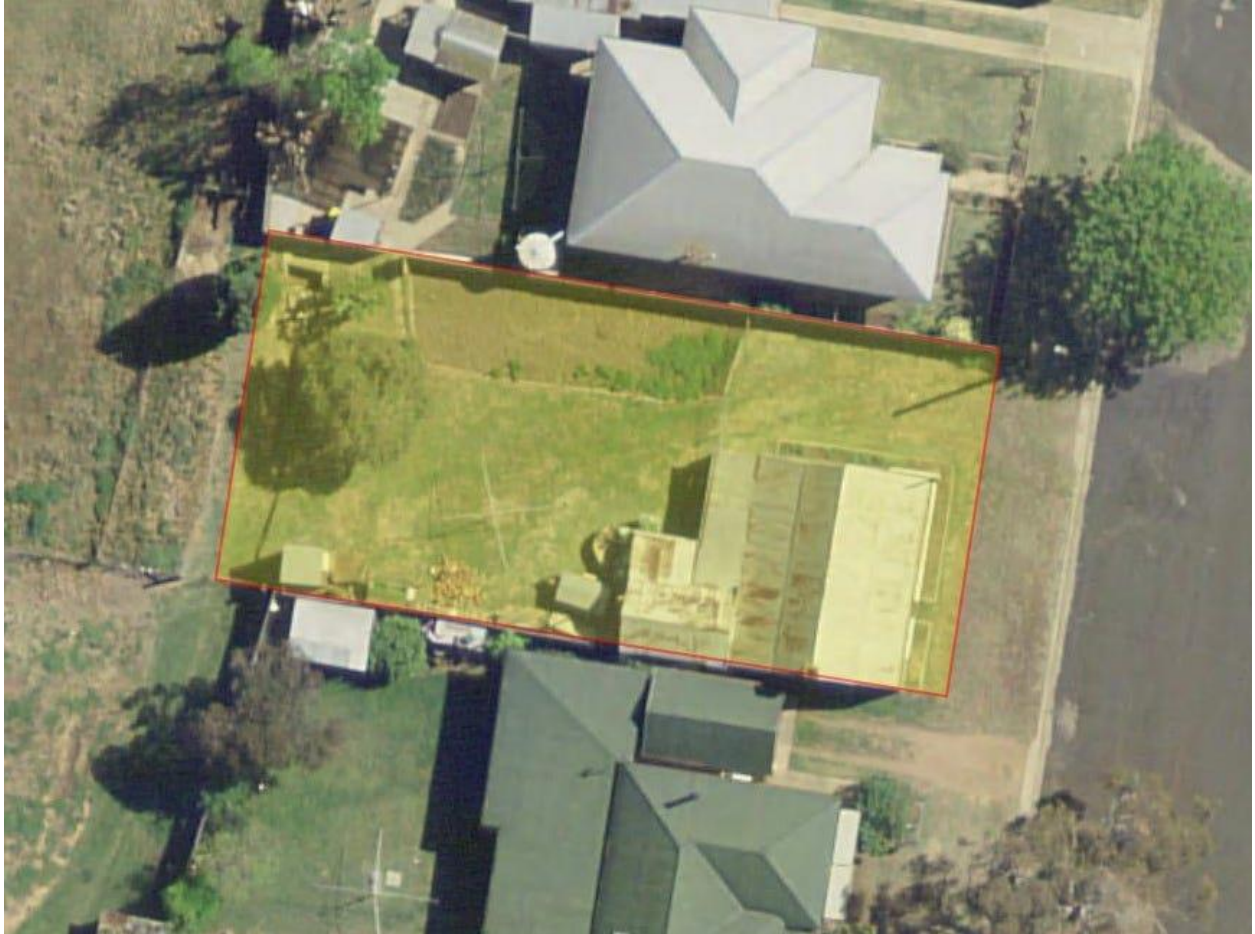
Aerial View of 66 Cox Street by First National Real Estate agent. April 2024.