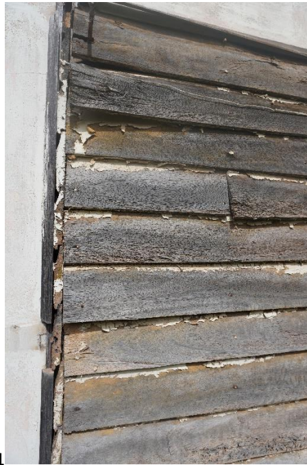
Fine weatherboards on façade