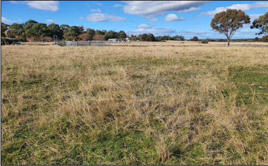
Looking east over the recommended the application area