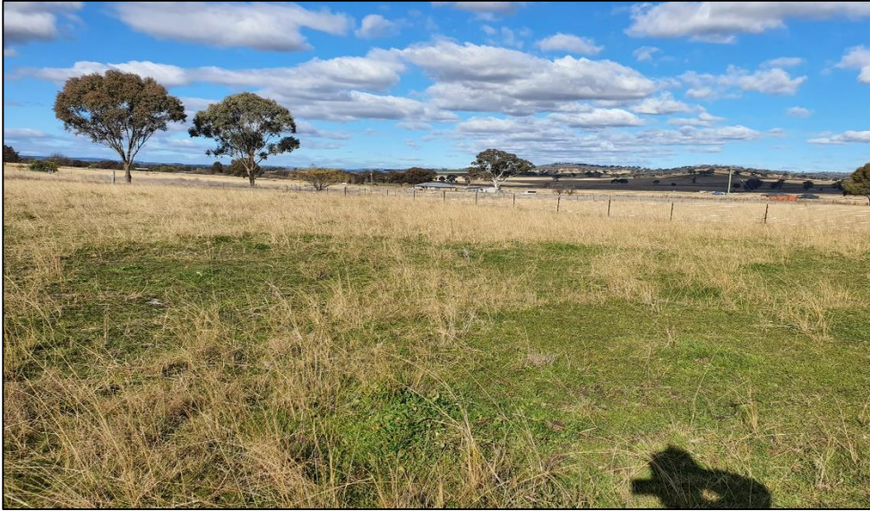
Looking east over the recommended the application area