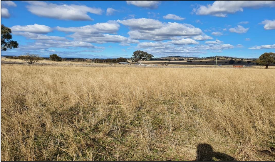
Looking east over the recommended the application area