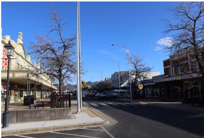
View south, Church Street

This Heritage Impact Statement was prepared by Bruce Dawbin M.ICOMOS