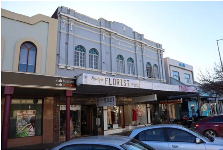
Adjacent heritage item, 62 Church Street