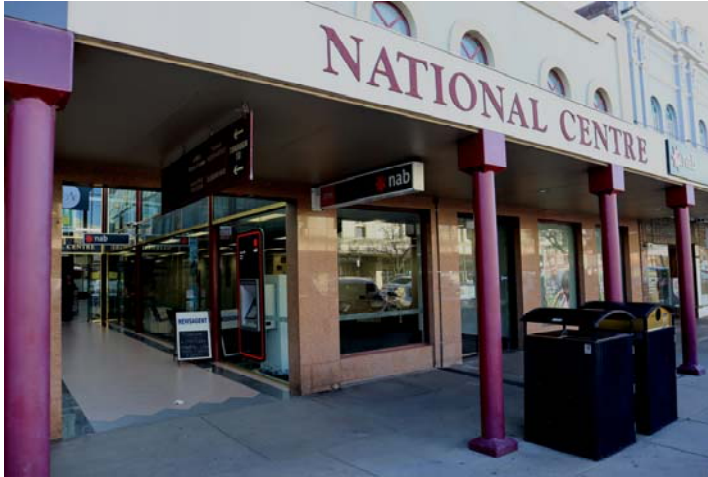
Mudgee NAB Branch at the National Centre Building, 64- 66 Church Street