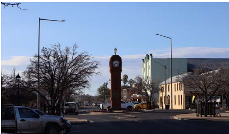
Clock tower, corner Market Street and Church Street