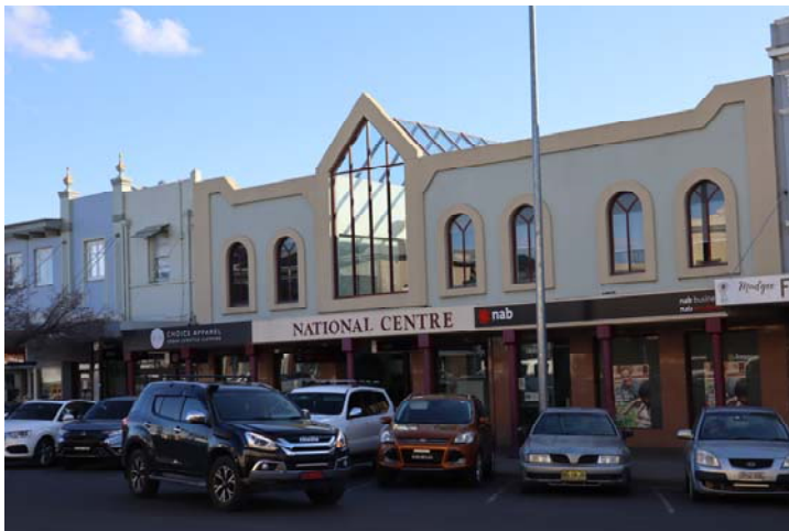
The subject site