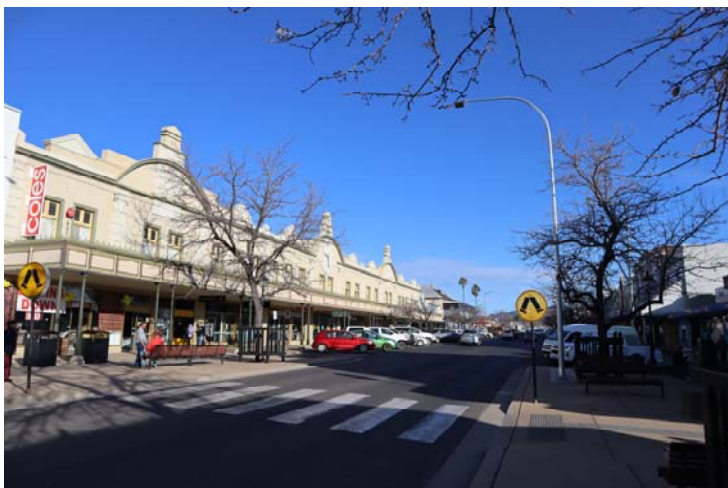
Town Centre Store