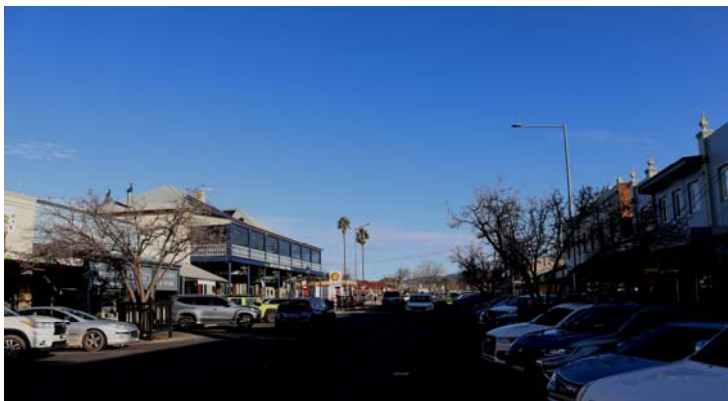
Kellys Irish Pub and Church Street