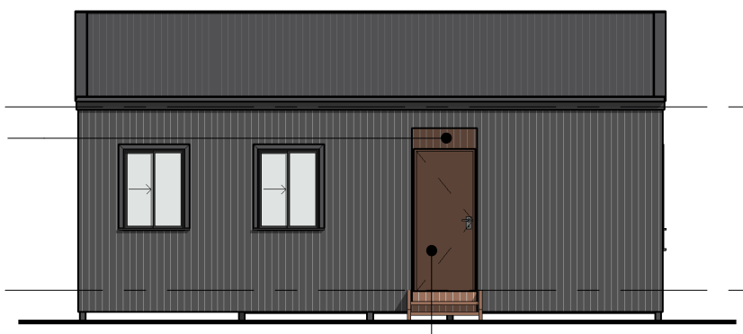
2 NE ELEVATION SCALE 1 : 100

SELECTED VERTICAL GROOVE TIMBER CLADDING TO ENTRY ALCOVE