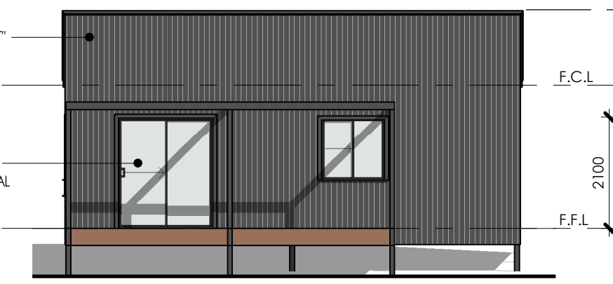
3 SW ELEVATION SCALE 1 : 100

ALUMINIUM FRAMED SLIDING GLASS DOOR WITH PAINTED TIMBER EXTERNAL ARCHITRAVE