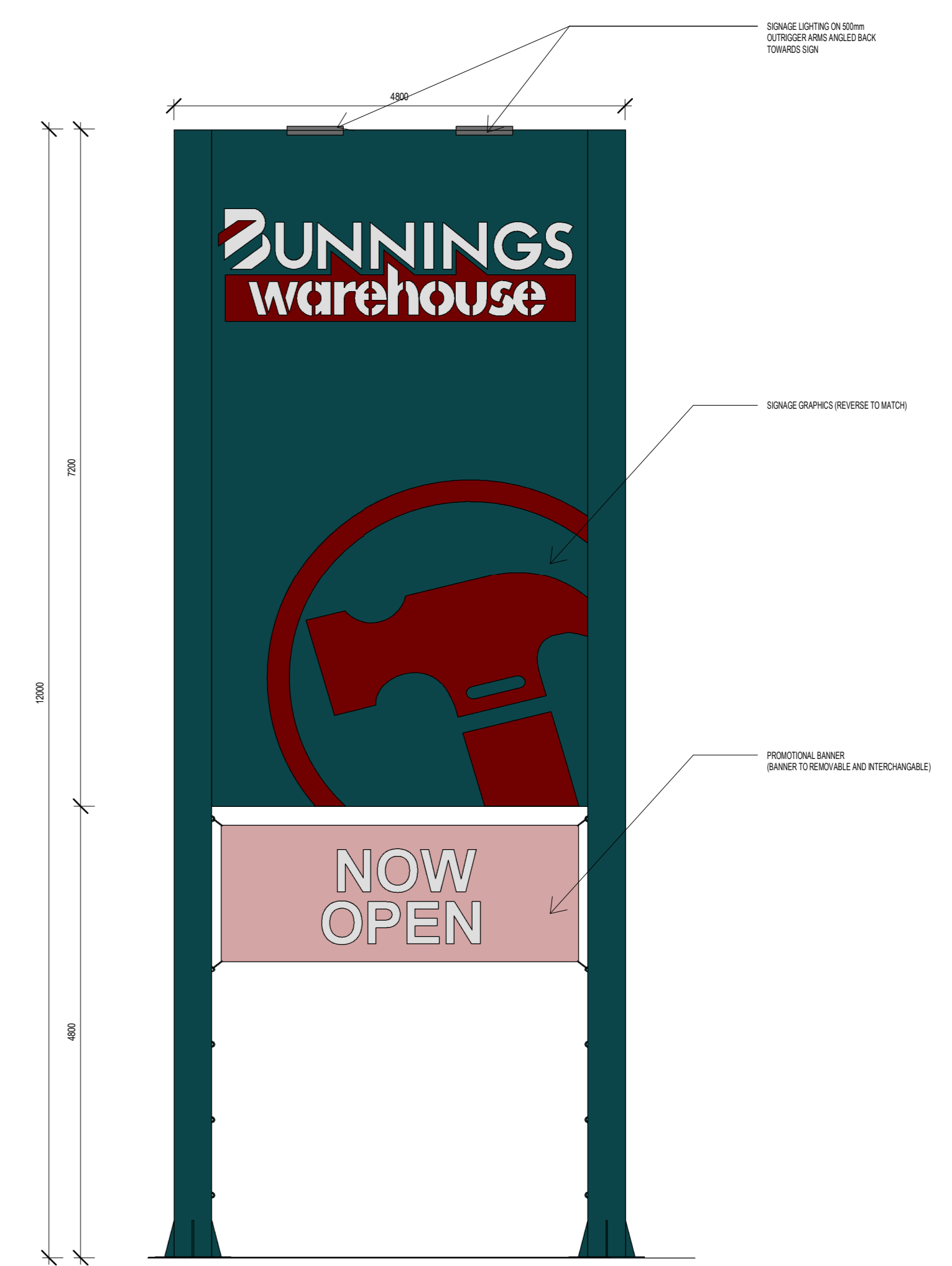
PYLON SIGN 1:50@A0