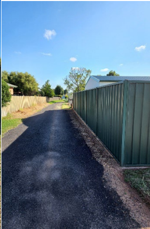
fence line on lane