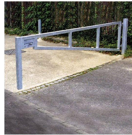
[GAT] 3700MM WIDE SWING BARRIER GATE