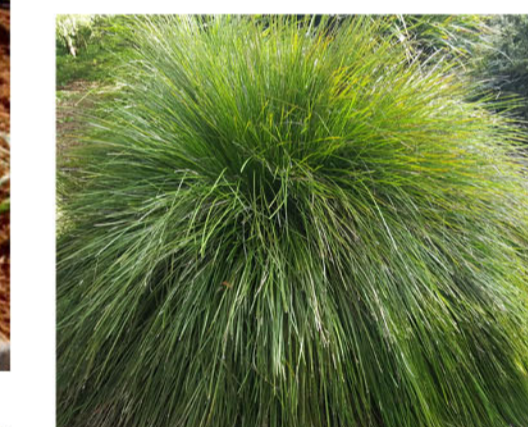
LOMANDRA LONGIFOLIA 'TANIKA' MATT RUSH

TO BE PLANTED IN DRIFTS TO ACHIEVE A NATURAL AESTHETIC