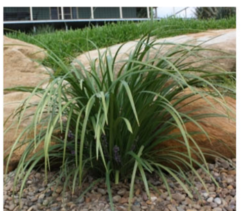
LIRIOPE MUSCARI 'JUST RIGHT' LILY TURF