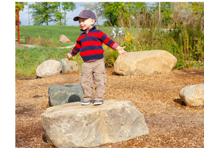
BOULDERS FOR USE AS INFORMAL SEATING / PLAY