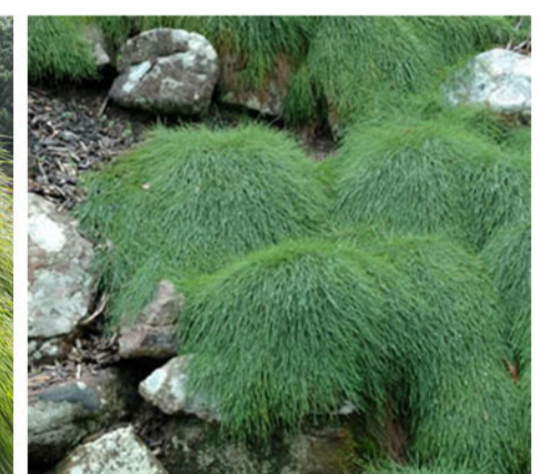
CASUARINA GLAUCA 'COUSIN IT' PROSTRATE SHEOAK