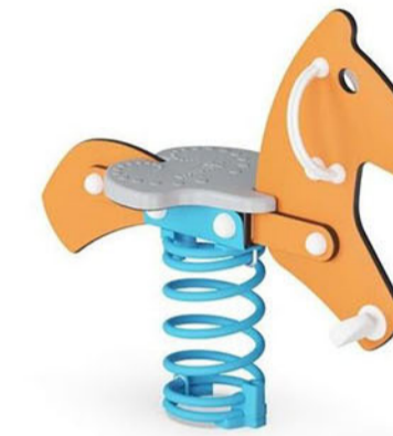
[EQP2] SPRINGER (TODDLER)