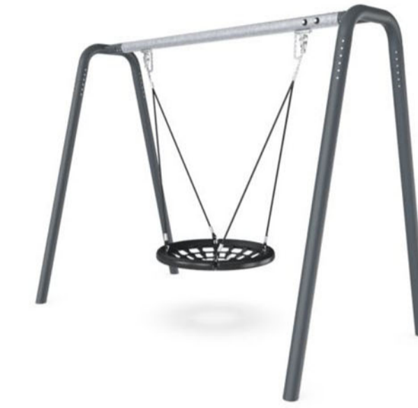
[EQP3] BASKET SWING