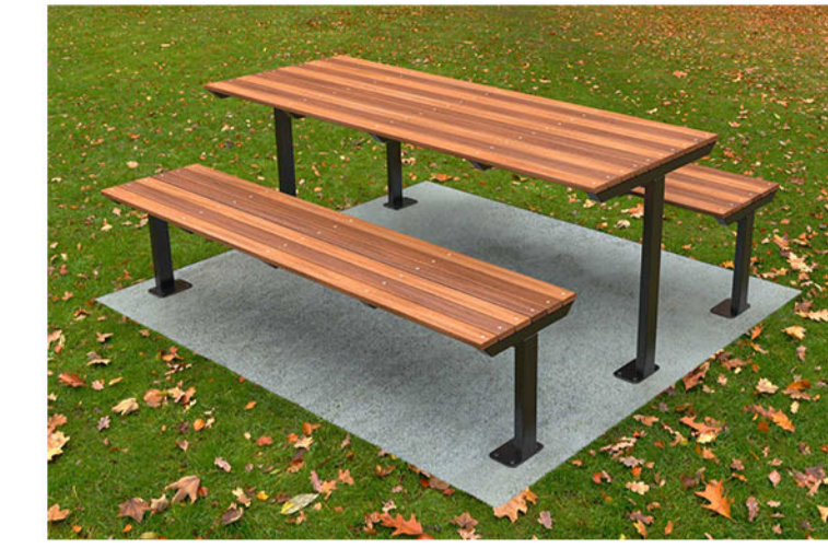
[PIC] PICNIC BENCH SETTING WITH TIMBER / COMPOSITE BATTENS