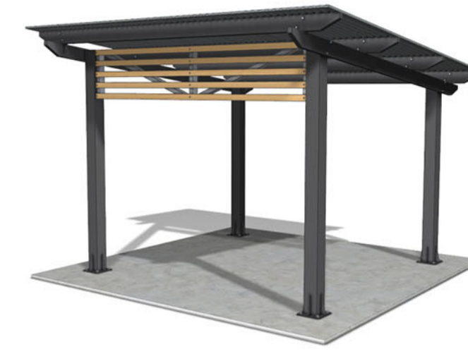
[SHLT] 4000 x 4000MM PICNIC SHELTER