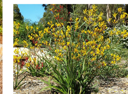
ANIGOZANTHOS 'YELLOW GEM' KANGAROO PAW