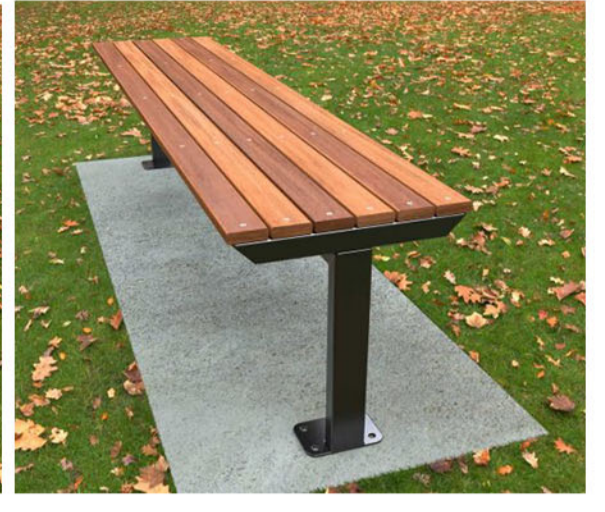
[BEN] BENCH WITH TIMBER / COMPOSITE BATTENS