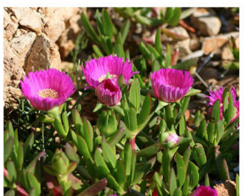
CARPOBROTUS GLAUCCENS PIG FACE