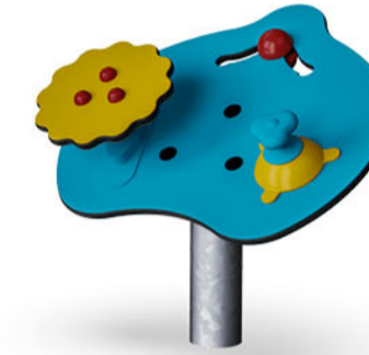
[EQP1] PLAY PANEL (TODDLER)