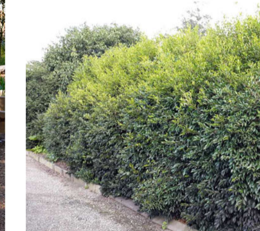
ACMENA SMITHII 'SUBLIME' SUBLIME LILLY PILLY