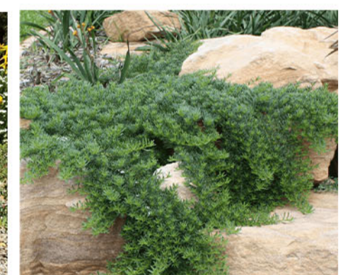
MYOPORUM PARVIFOLIUM CREEPING BOOBIALLA