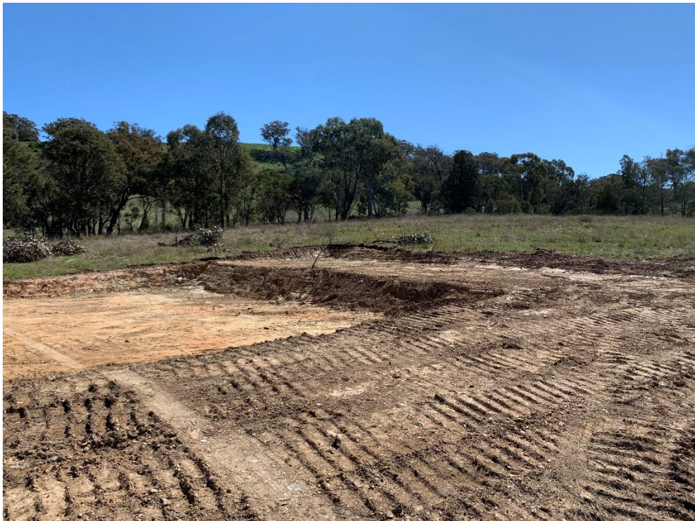
Plate 1 – Northwest facing view.

The site is sloping slightly to the east. The block consists of cut and fill pad for the proposed dwelling with existing rural farmland and grazing land surrounding the area.