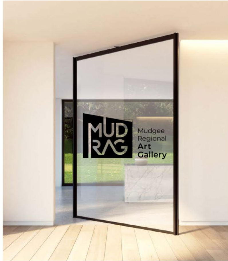
MUDGEE REGIONAL ART GALLERY Logo Development