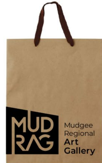
MUDGEE REGIONAL ART GALLERY Logo Development