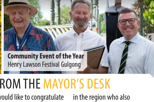
Community Event of the Year Henry Lawson Festival Gulgong